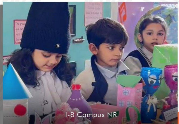
I-8 Campus NR