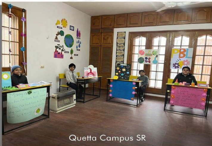
Quetta Campus SR

Judged by experts and cheered on by an enthusiastic parent body, the event celebrated collaboration, learning, and innovation, with school-level winners selected from each category. A proud moment for our students, parents, and schools alike!