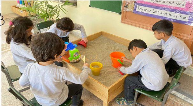
Learning by Doing: Turning Ideas into Reality!

At TRES, we believe in hands-on learning that brings theory to life. By engaging in real world activities and interactive projects, students develop critical thinking, problem-solving, and creativity.