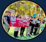
Winners Category 3 University Town Peshawar