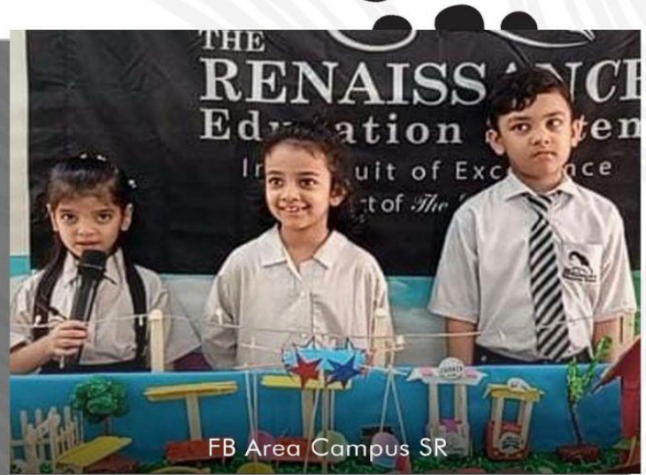
FB Area Campus SR