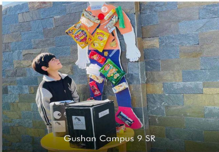
Gushan Campus 9 SR

Judges select the best, but every student is a star at PBL Showcase Week!