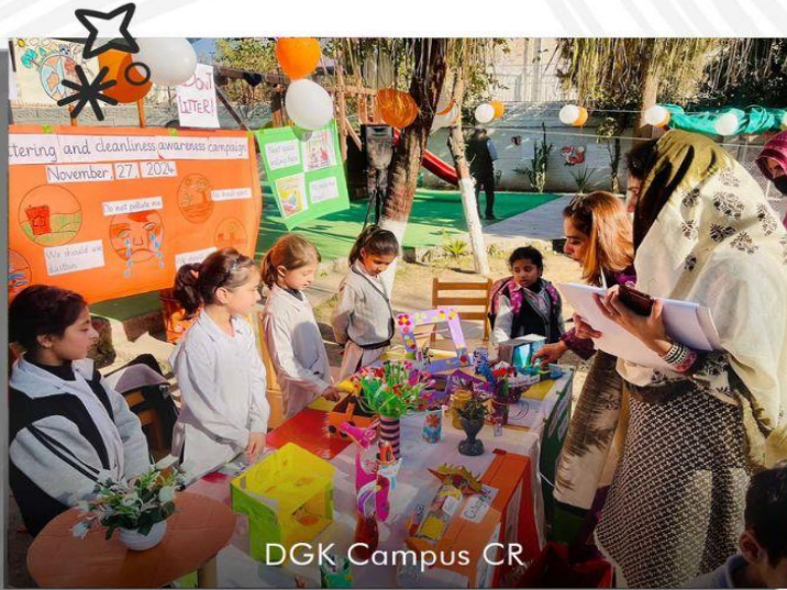
DGK Campus CR