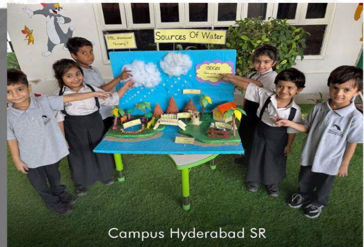
Campus Hyderabad SR

From Ideas to Impact: Students Shine at PBL Showcase Week!