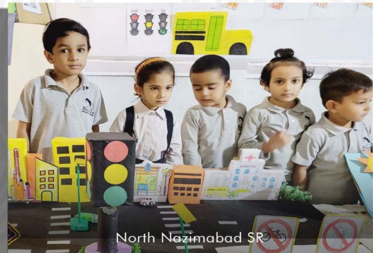
North Nazimabad SR