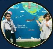
Winners Category 2 North Nazimabad