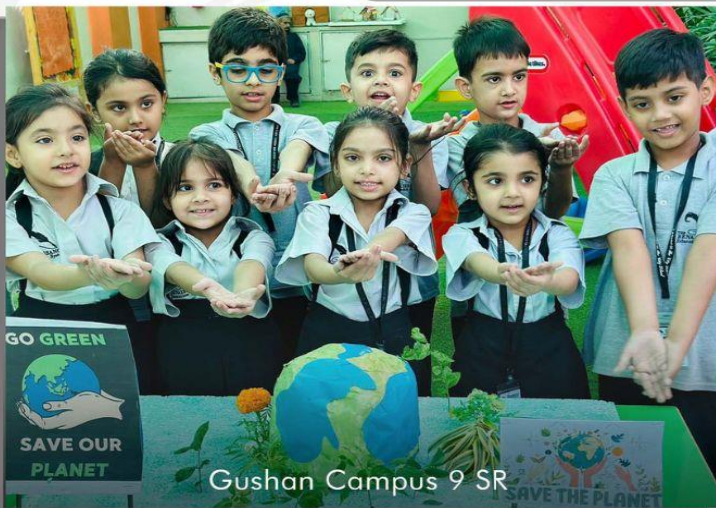
Gushan Campus 9 SR