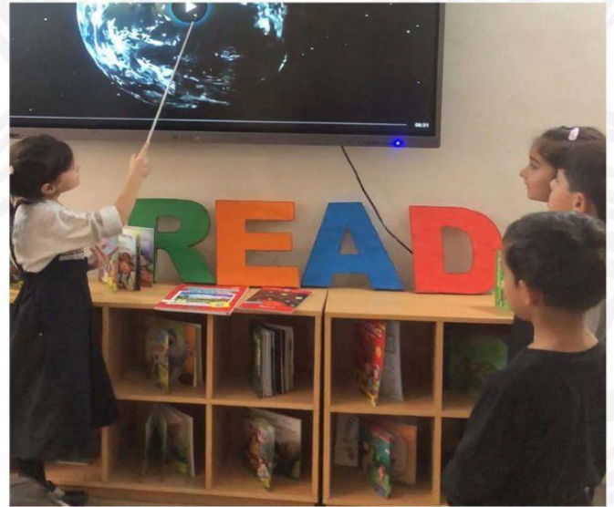
Empowering Learning: Innovation and Technology!

Technology integration is at the heart of modern education at TRES thanks to TRES Touch. With cutting-edge tools and digital resources, we enhance student engagement, broaden learning horizons, and prepare them for a tech-savvy future.