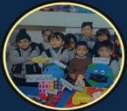
Winners Category 1 University Town Peshawar

NATIONAL LEVEL PBL WINNERS Project-Based Learning