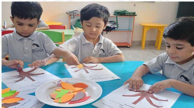
Learning becomes an adventure when you get your hands dirty!