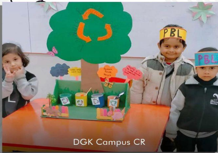
DGK Campus CR