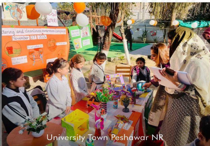
University Town Peshawar NR

From Ideas to Impact: Students Shine at PBL Showcase Week!