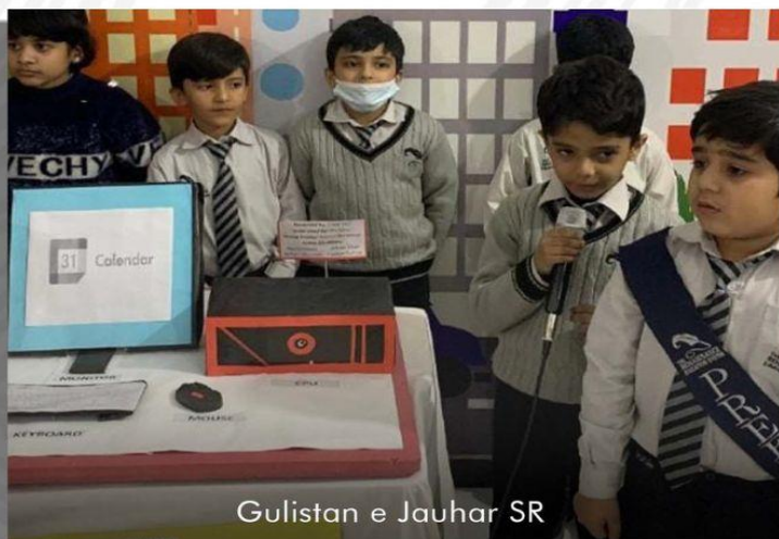
Gulistan e Jauhar SR

Innovation in Action Celebrating Creativity at PBL Showcase Week!