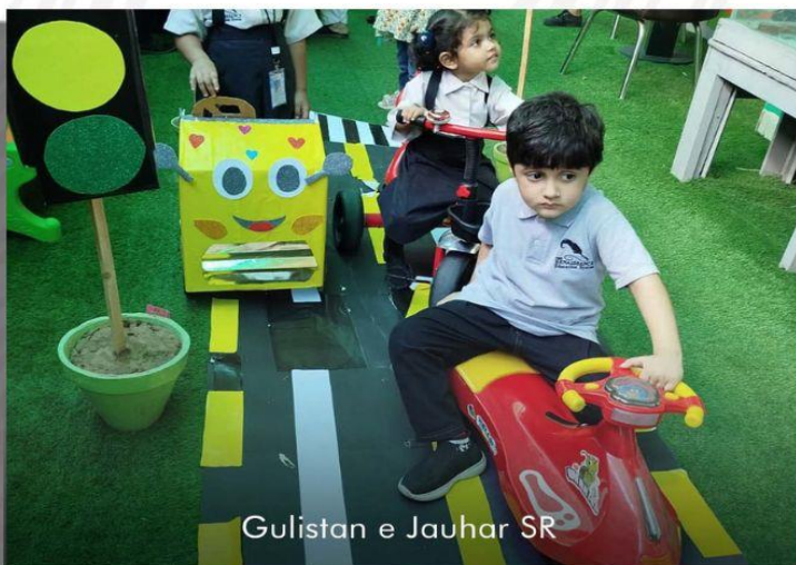
Gulistan e Jauhar SR